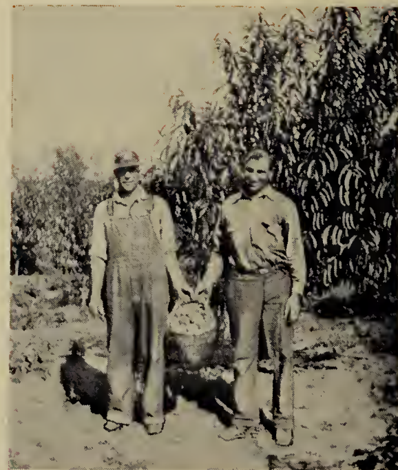
Pacific Gold Trees Bear When Others Fail

The flesh is firm and solid and a very good canner. It is a good tree-ripened shipping peach with a small free-stone. The skin of this peach is as nearly fuzzless as any peach now being raised.